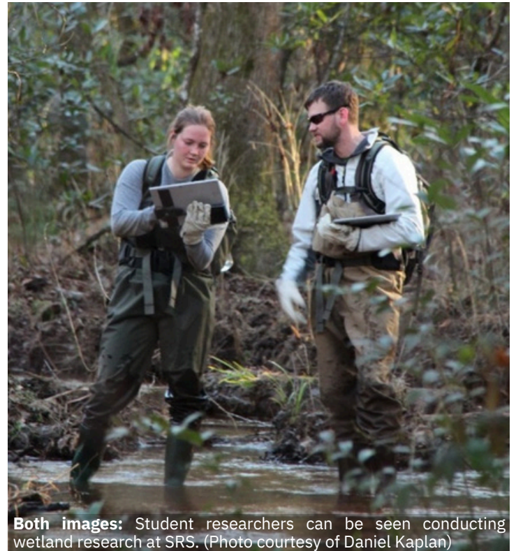
Both images: Student researchers can be seen conducting wetland research at SRS.