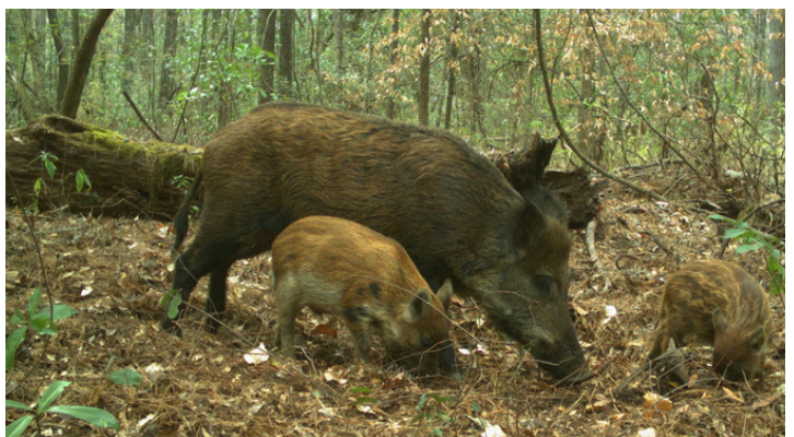
Top: A sounder (group) of wild pigs foraging next to a wetland.